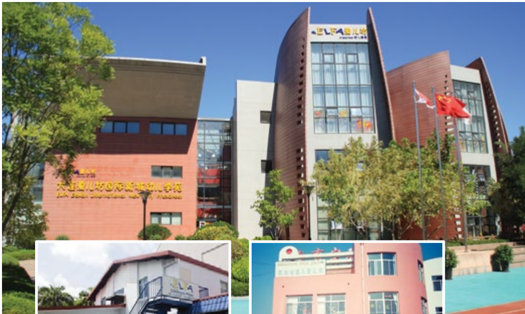
2013 - Widely acclaimed architecture design of ELFA Dalian International New City Preschool