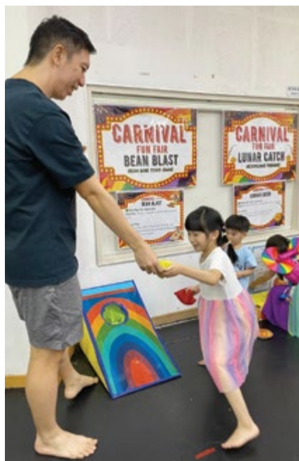
Families enjoyed carnival games at ELFA Preschool @ Hougang.

At ELFA Preschool @ Jurong East, the day combined the spirit of Children's Day and the Mid-Autumn Festival — with lively performances, mooncake-making, and a glowing lantern walk celebrating unity, tradition, and love.