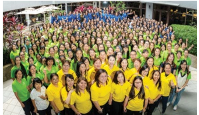
Over 300 of CEG's best in attendance at YWCA Fort Canning and Singapore Shopping Centre for the annual PD Day.

Intelligence with Inclusive Early Education," the event featured workshops on AI integration, emotional wellness, and child safeguarding. Educators explored tools like ChatGPT, strategies for empathy and mental health support, and practical self-care techniques, reinforcing that future-ready classrooms thrive on both technology and compassion.