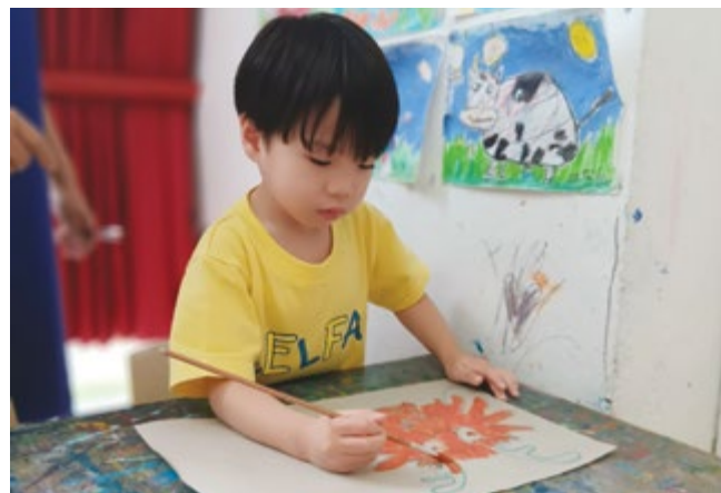
Exploring creativity through watercolour painting at ELFA Creative Art Atelier.

ELFA's Creative Art Programme uses Eastern and Western art methods to nurture calmness, composure, and creativity. Through pottery, painting, and calligraphy, children explore freely, developing aesthetic sense, positive learning dispositions, and a lifelong love for art.