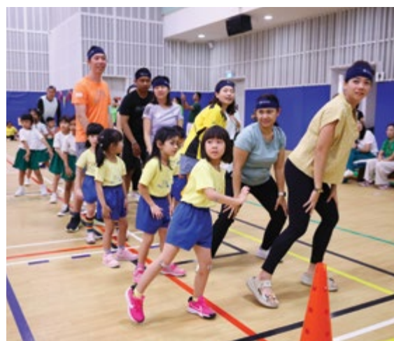
Parents and children teamed up during the Sports Fiesta, showcasing strong family bonds through teamwork and shared joy.