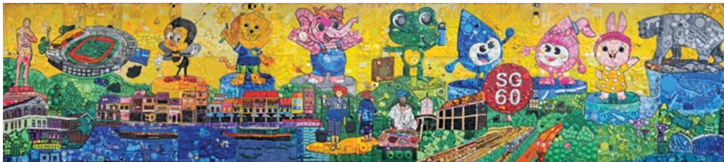
The Art Mural measuring 13.6 metres wide and 2.1 metres high, is displayed at Promenade MRT Station.

The largest mural made of reused plastics, "Building Our Nation Over Generations," recognised by the Singapore Book of Records, was unveiled on 2 July 2025 at Promenade MRT Station.