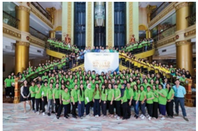
Our big Kinderland and ELFA family together with the senior management at the Pacific Palace Hotel, Batam, Indonesia.