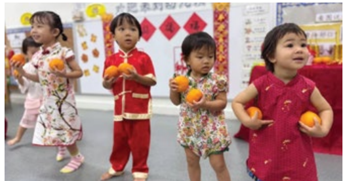
Dancing to the beat of "Gong Xi Gong Xi" at ELFA Preschool @ Jurong East.

ELFA Preschool @ Jurong East, children discovered the festival's origins through engaging storytelling, songs, and creative crafts. While at ELFA Preschool @ Hougang, families celebrated the Lantern Festival with lanterns and riddles, calligraphy, and tang yuan — symbolising unity and joy. The festivities ended with a cheerful Lo Hei toss, reflecting