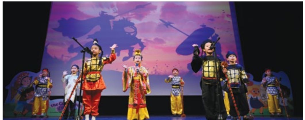
ELFA children displayed confidence and sharpness of speech through the Chinese Speech & Drama item, "Legendary Fighter: Yang's Heroine" at ELFA's graduation and year-end concert 2024.

ELFA's Chinese Speech & Drama programme strengthens Mandarin communication while nurturing creativity, confidence, and social skills, empowering children to express themselves clearly and confidently.