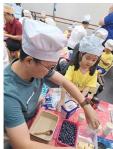
Fathers and children bonded through paper art and preparing dishes. These heartwarming moments fostered connection, learning, and joy, creating lasting memories of shared fun.