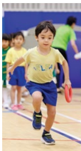
Full of energy and excitement, our children gave their best in the Donut-Run relay!

On 11 October 2025, ELFA Preschool joined the ELFA and Kinderland Sports Fiesta at the Singapore Institute of Management Sports Hall. The event was graced by Singapore's first Olympic gold medallist and Kinderland alumnus, Joseph Schooling, who delivered the opening address. Showcasing ELFA's commitment to holistic learning, children and families engaged in fun physical activities like Parachute Party , Dance Jam , Family Leap , and Tug of War that promoted teamwork, resilience, and joy — reflecting ELFA's belief in learning through active play.