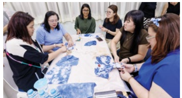
A wonderful bonding moment as Centre Leaders collaborated to create their beautiful indigo tie-dye masterpieces.

A team of expert from China led this hands-on session and inspired our Centre Leaders to explore this ancient art form, creating indigo patterns that symbolise harmony, good wishes, and blessings. This was a fruitful exchange celebrating culture through practical learning and artistic expression.