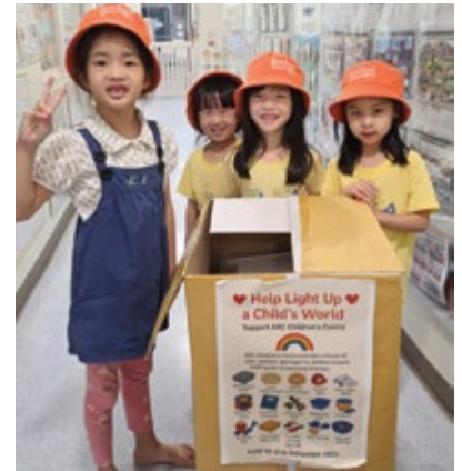
Children from ELFA Preschool @ Hougang packing items generously donated by parents for the ARC Children's Centre.