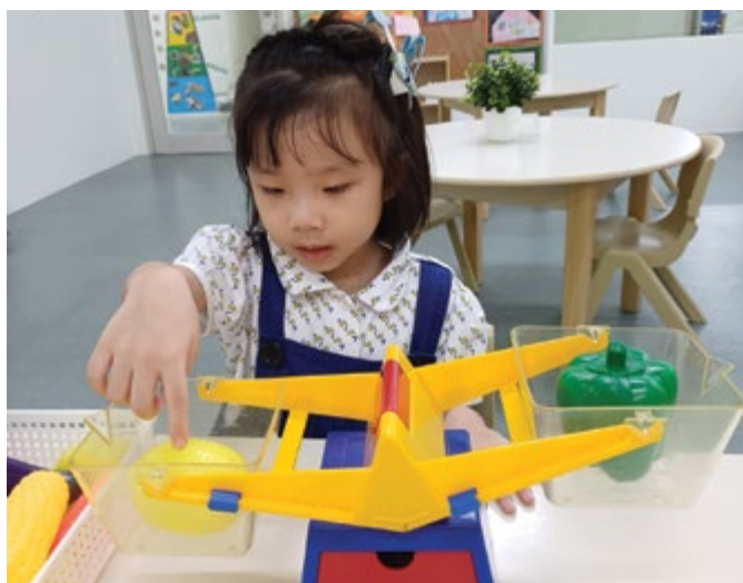
Learning the concept of weight through fun and hands-on activities.

ELFA's unique Higher-Order-Thinking Maths programme brings concepts to life, fostering logical reasoning, sequencing, classification, and problem-solving, while enabling children to apply these skills meaningfully in daily life.