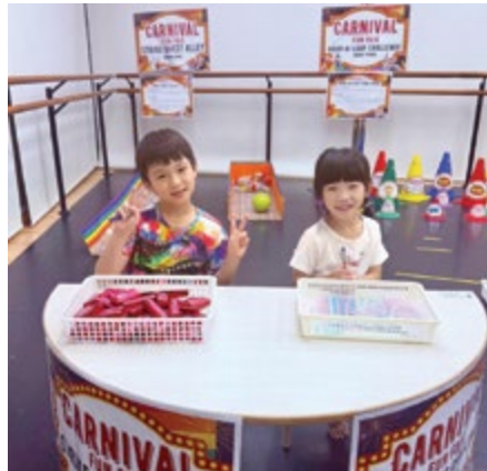
Children kicked off the Children's Day Family Carnival with SSDB at ELFA Preschool @ Hougang by preparing small gifts for each game booth!

This year's Start Small, Dream Big (SSDB) project celebrates community service and kindness. ELFA Preschools @ Hougang and Jurong East integrated SSDB into their Children's Day and Father's Day events, uniting families through creative, hands-on activities. All proceeds support the ARC Children's Centre, bringing hope to children with critical illnesses.