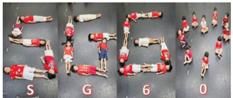
With teamwork and creativity, our children collaborated to form the word “SG60” to commemorate Singapore’s 60 th anniversary.