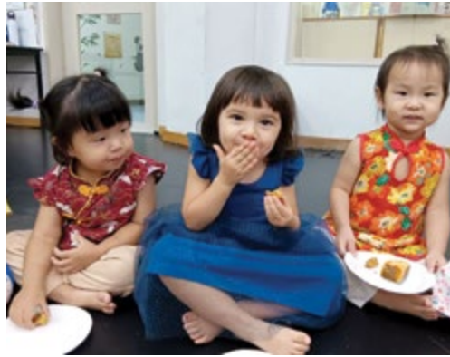
Children at ELFA Preschool @ Hougang savouring sweet moments with mooncakes.

This October, ELFA Preschools were filled with music, laughter, and glowing lanterns as children celebrated the Mid-Autumn Festival. At ELFA Preschool @ Jurong East, families enjoyed performances, mooncake decorating, and an evening lantern walk promoting family love and togetherness. At ELFA Preschool @ Hougang, storytelling, songs, and crafts brought the legend of Chang'e to life. Through these joyful experiences, children discovered the festival's meaning of reunion, gratitude, and harmony, where culture and learning shine together.