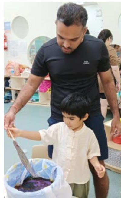
Parents and children of ELFA Preschool @ Jurong East created traditional fans for the Mid-Autumn Festival, as part of Children's Day celebration.