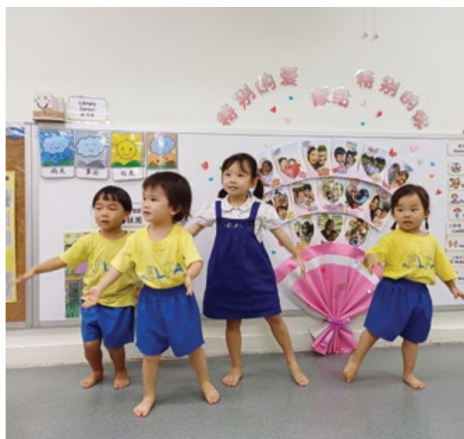
Mothers and children bonding through fun workouts and creative DIY tote-making, filling every moment with laughter, love, and lasting memories!