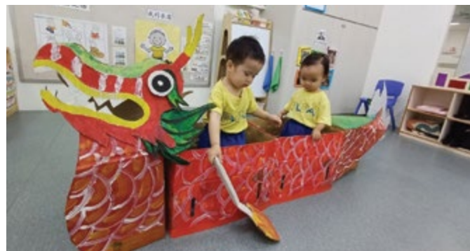
Exploring the excitement of dragon boat race.

At ELFA Preschool @ Jurong East, children embarked on a cultural journey to explore the Dragon Boat Festival and its rich traditions. Through a beautifully illustrated storybook, they learned the legend of Qu Yuan and customs like making zongzi and having