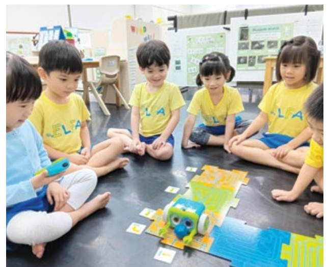
Developing foundational coding skills through hands-on activities, using a fun, interactive robot to explore basic programming concepts.

ELFA's coding programme strengthens logical thinking, problem-solving, and creativity, teaching children to design and build programmes while developing resilience and practical skills for a future-ready, digital-centric life.