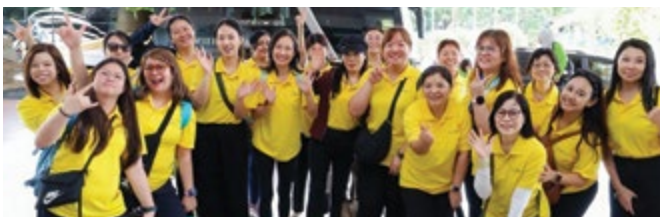
Grateful to our ELFA team for standing united in nurturing every child with care and dedication for over 25 years.

Themed "United We Stand – Building Resilience and Strength," Kinderland and ELFA Day 2025 in Batam marked the first overseas celebration for over 200 educators, featuring leadership highlights, staff recognition, and meaningful team bonding while exploring Batam's landmarks together.