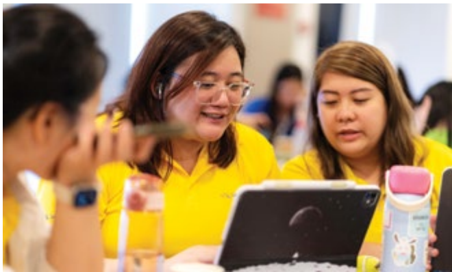
ELFA educators explored hands-on workshops on Applied AI and Generative AI, learning to personalise teaching with ChatGPT while ensuring digital safety.

On 4 July 2025, over 300 educators from Kinderland, ELFA, and NurtureStars gathered for Crestar Education Group's 7 th Professional Development Day at YWCA Fort Canning and Singapore Shopping Centre. Themed "Future-Ready Classrooms: Artificial and Emotional