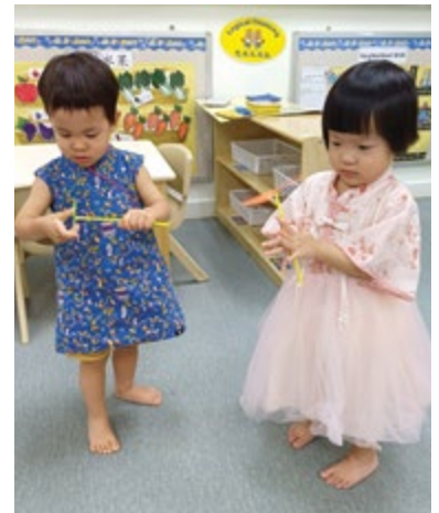
Children embraced cultural learning by dressing in traditional attire and engaging in meaningful, creative activities and games.