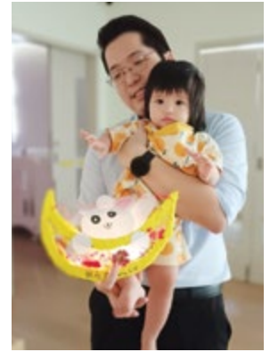
Parents and children of ELFA Preschool @ Jurong East made lanterns for the Mid-Autumn Festival.