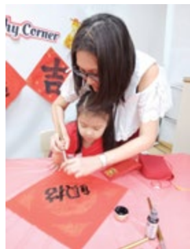
Mother and child immersed in the art of calligraphy at ELFA Preschool @ Hougang.

At ELFA Preschools, Chinese New Year is more than a celebration — it is a vibrant learning experience that nurtures cultural appreciation and family bonding. At