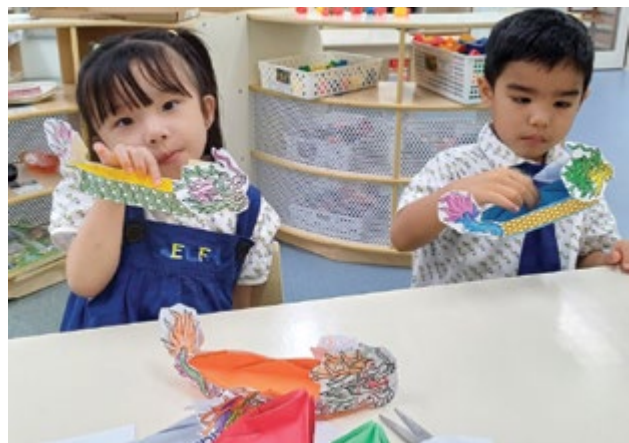
Children at ELFA Preschool @ Jurong East are joyfully exploring the story and moral values behind 端午节 (Dragon Boat Festival).

Through ELFA's bilingual, story-based Mandarin curriculum, children explore Chinese folklore and moral lessons that nurture language mastery, cultural understanding, and positive character development.