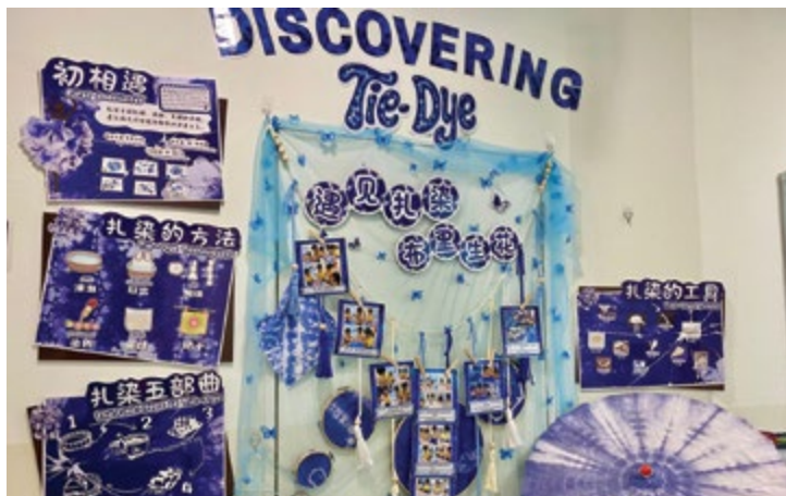
Indigo comes to life — from curious hands to beautiful creations, capturing each step of our tie-dye journey.