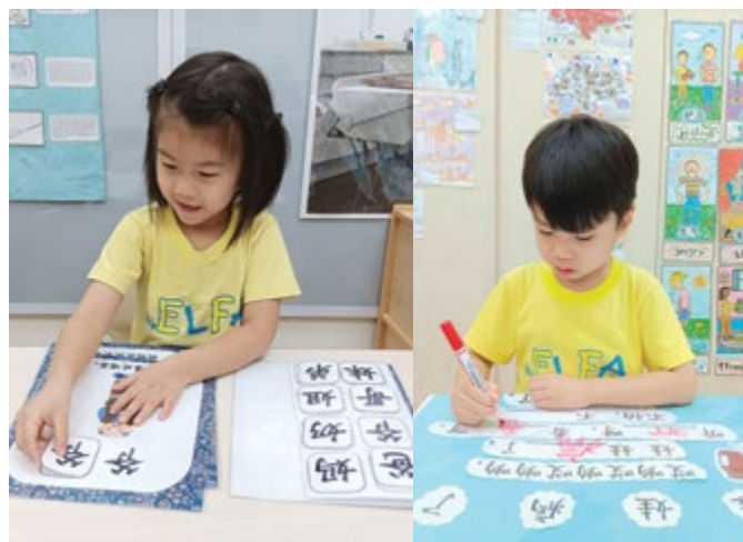
Children at ELFA Preschool @ Hougang explore words and practice writing through interactive cards and fill-in-the-blank practices.

At ELFA Preschool, we nurture young minds through a balanced bilingual curriculum that builds creativity, critical thinking, and cultural appreciation. With a strong emphasis on Mandarin, we focus on developing children's oral language and reading skills through early immersion in Chinese language and culture. Using theme-based stories and engaging activities, we spark children's love for Mandarin while enhancing literacy in both English and Chinese — helping them grow confidently as bilingual learners.